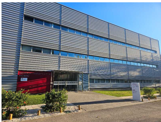
Figure 1: The Institute of Space Sciences in Bellaterra (Barcelona).

As already advertised in the last newsletter 2023/3, the next Pencil Code User Meeting will be held at the Institute of Space Sciences on the Campus of University Autònoma de Barcelona during September 23–27, 2024; see Figures 1 and 2.